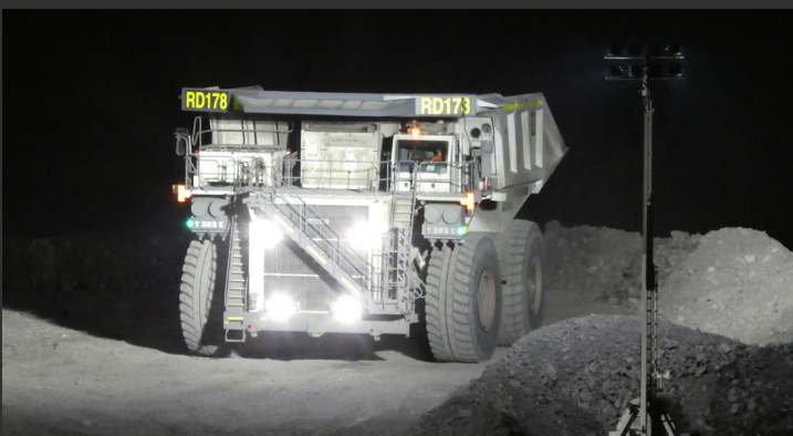
Various light colours allow for a brightly lit working environment at night