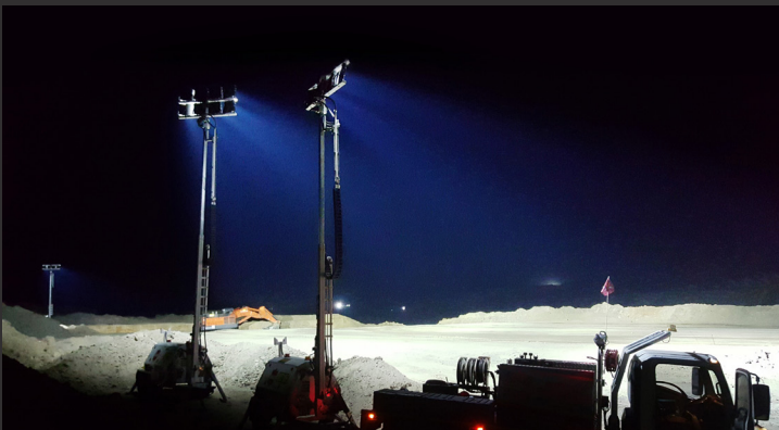
Choosing the right optics ensures proper illumination of important area's

Power : 320W Light output : 40.800 lm Efficiency : 127 lm/W Voltage : 24V (20-35V)